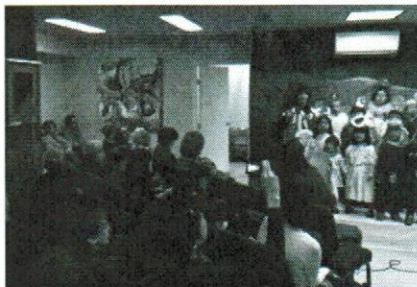
Christmas Program-Praying for Easter!